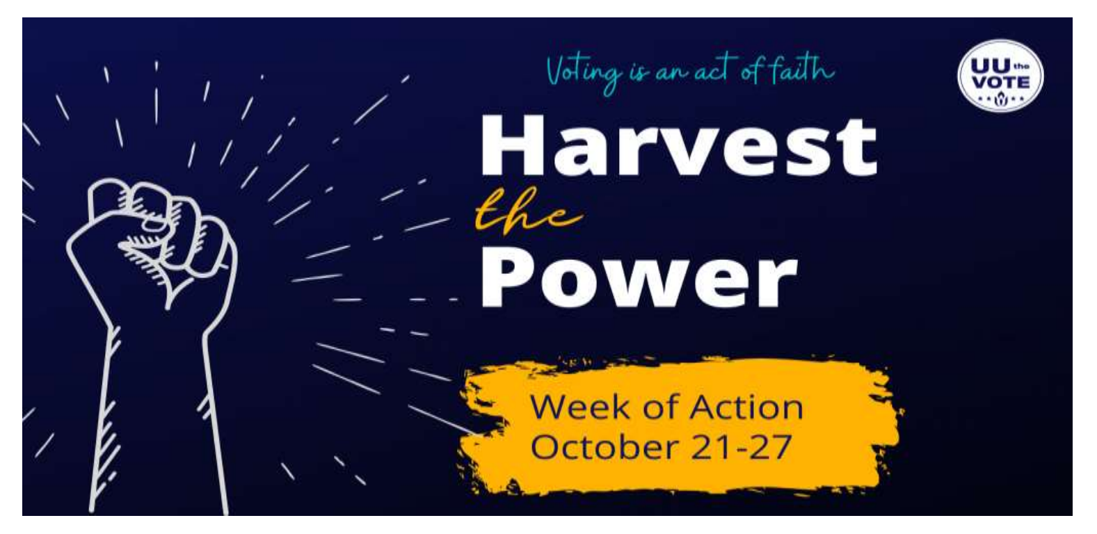
Details on how you can participate are listed on the next page