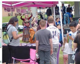
Belly Dancers, and more